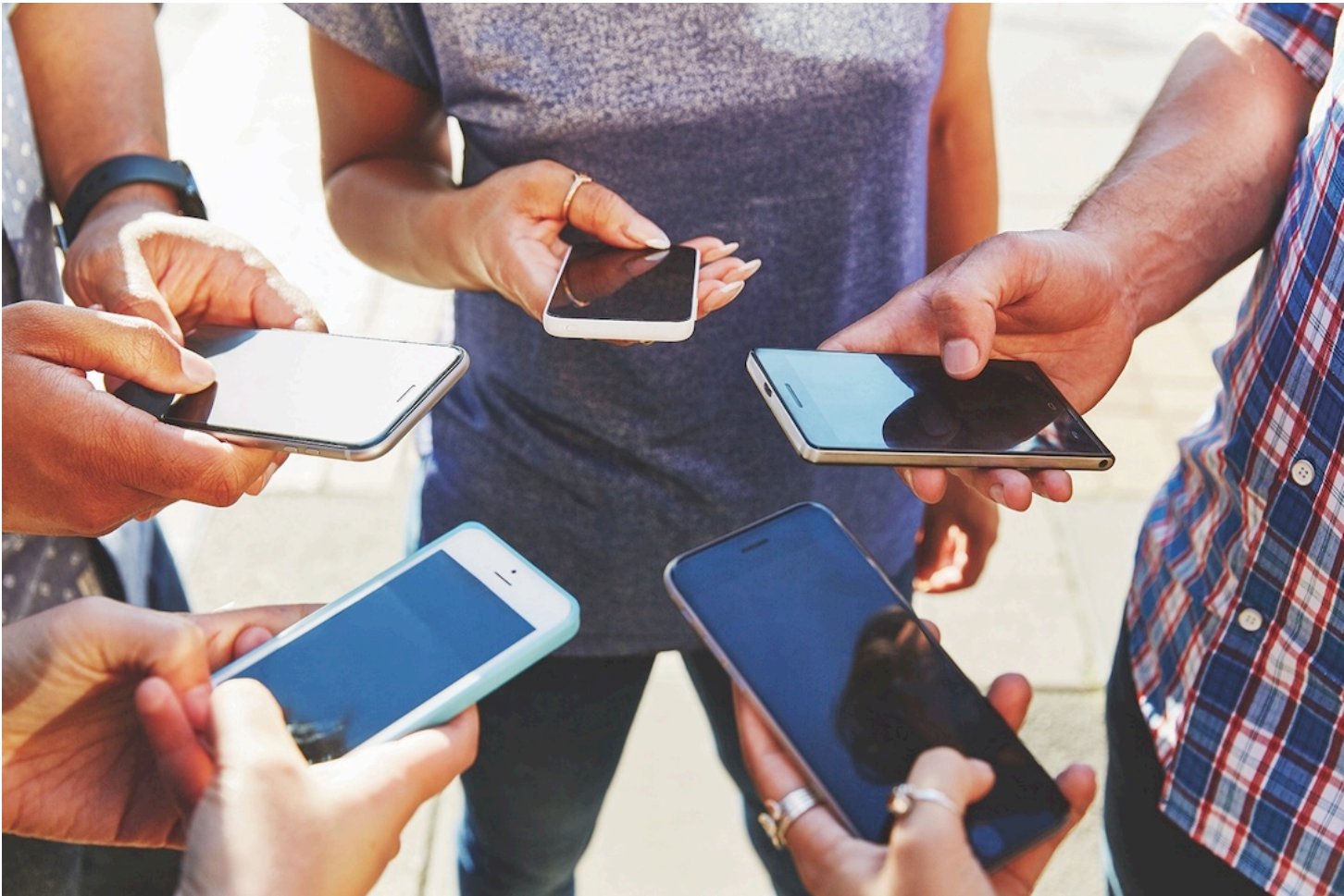
Metro Creative Graphics

Featured News - Current News - Archived News - News Categories